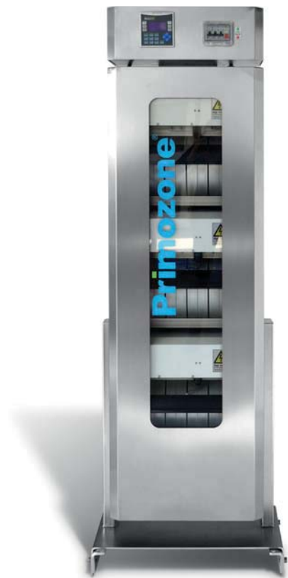
Primozone GM18 - capacity 1kg O 3 /h (53 lbs/day)

Precise dosing - integrated control system with unique features that will vary the dosing provide the desired ozone level at any given time