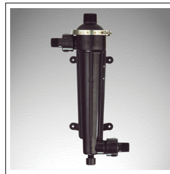
Black PVDF Separator