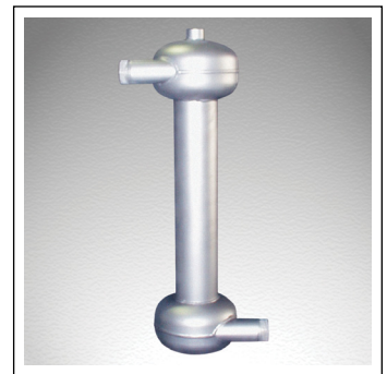
Standard Stainless Steel Separator