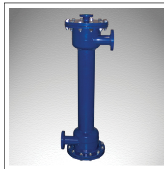
Powder Coating or Scotchkote™ Interior

The Mazzei GDT™ Degaser is a patented unit that utilizes centrifugal force to create a vortex enabling entrained gases to be extracted from water. The water-entrained gas mixture enters the top of the separator tangentially and flows through an accelerator plate, which increases velocity. The water spins down through the separator and exits the bottom. The entrained gas travels through the vortex where it passes into a collector and flows out the top of the separator. The separated gases exit the separator through a degas relief valve.