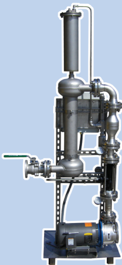
Ozone Transfer Skids Complete and portable