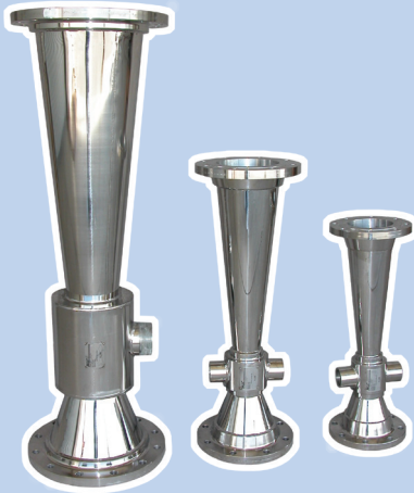
Mazzei® Injectors Various sizes and models to meet performance requirements