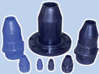
Mass Transfer Multiplier™ Nozzles Various sizes to match the application