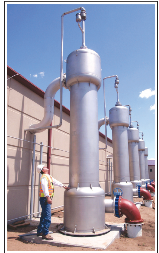
The six DS1600 LF units installed at the AOP Building in Wichita, Kansas

At the time of the AOP project discussions, the City of Wichita was currently using four (4) Mazzei GDT™ degas separators at the city's 74 MGD, Cheney pump station's pre-filter ozone system. These separators removed > 97% of