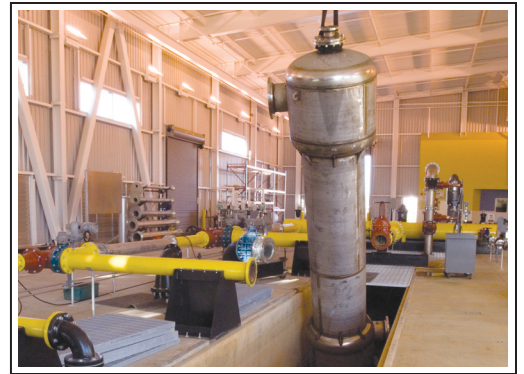
Testing of the DS1600 LF at the International Center for Water Technology at California State University, Fresno