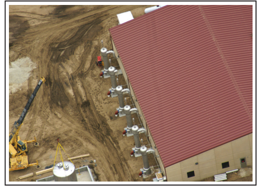
Aerial view of the DS1600 LFs and the AOP building during construction.