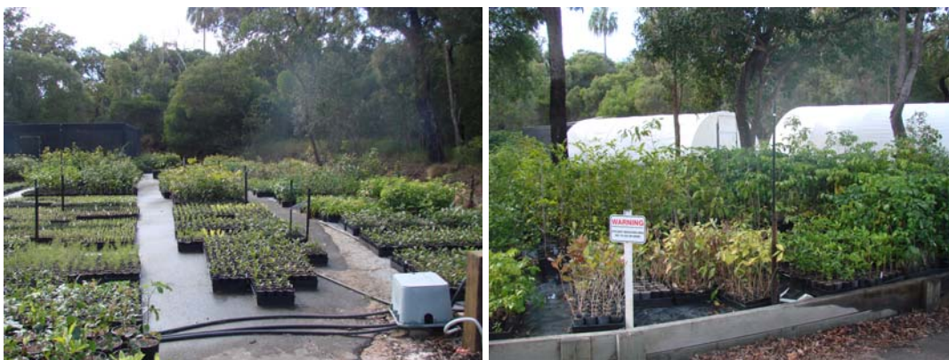
Figure 2: The Native Plant Nursery

100% of the recycled water produced at Sunrise at 1770 is recycled. The native plant nursery is the main user of the recycled water with approximately 200 000 seedlings currently under cultivation (Figure 2). Australian native plant species can be sensitive to certain constituents of water, in particular sodium and phosphorus (Bond 1998). The water operators liaise closely with the botanists on staff to ensure that there are no plant health issues in regards to the recycled water. The plants raised in this nursery have a special meaning to Australians as the majority of them were first identified by the botanist Sir Joseph Banks in 1770.